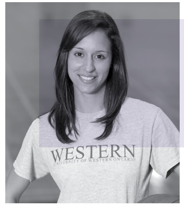
Explore the Faculty of Health Sciences website at www.uwo.ca/fhs