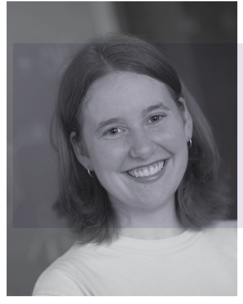
Nearly 12% of Western's total student population is enrolled in the Faculty of Health Sciences.