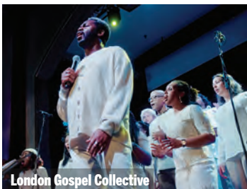
London Gospel Collective