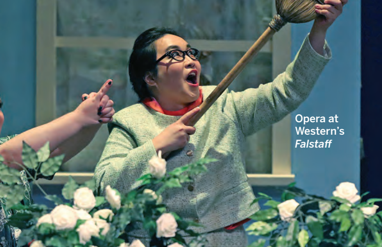
Opera at Western's Falstaff