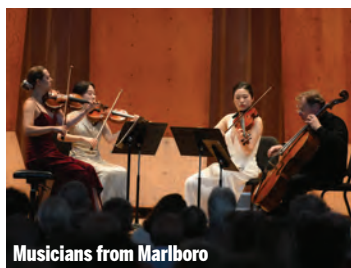
Musicians from Marlboro