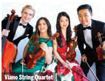
Viano String Quartet