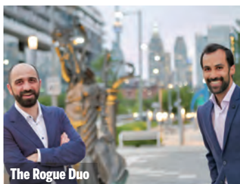
The Rogue Duo