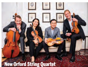
New Orford String Quartet