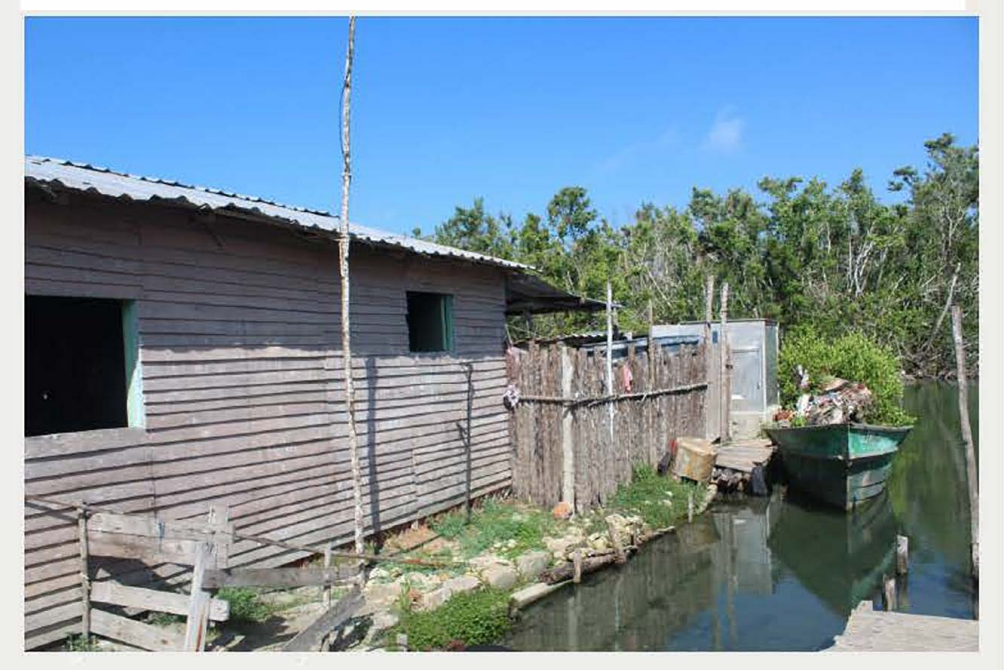
Both the challenges and the potential for Cajío's development were addressed.

On the morning of Saturday, May 17th, the first participatory workshop of the CIRCLE project took place in the Cajío community. It was a space designed to explore with the residents their perceptions about the urban and architectural conditions of their community, delving into the state of housing, public spaces, and service facilities.